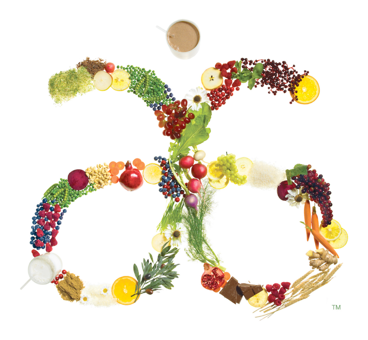
"Health is not valued until sickness comes." ~Dr Thomas Fuller

Congratulations on committing to learning to eat clean, naturally detoxify and develop NEW habits! Your friends, family and YOU are worth it. This is a step by step system that teaches you how to eat whole foods and which foods work FOR your body and which ones work AGAINST your body. Many people do not realize that extra fat/weight is an indication of toxic build up and nutritional deficiencies. Your consultant is here to help you every step of the way. Here's to you for taking control of your health!